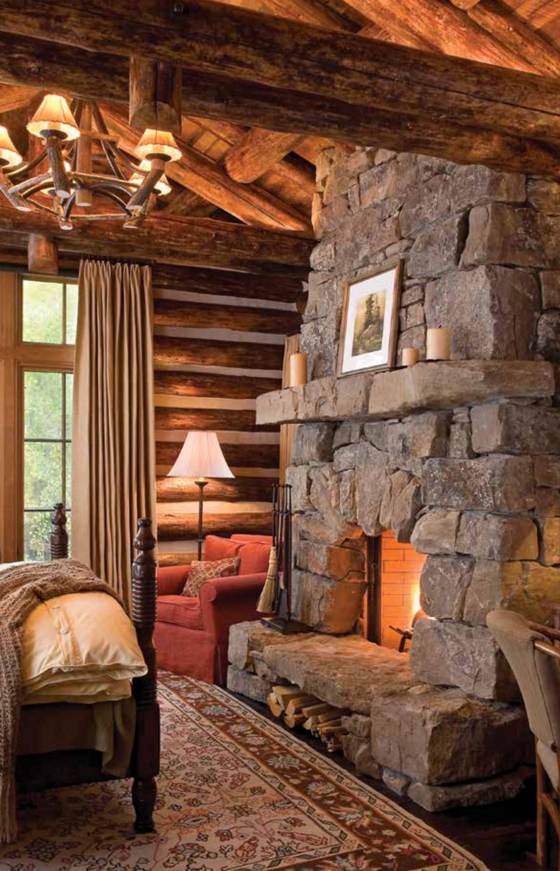
Above: In the master bedroom, lush linens and a roaring fire epitomize the beauty of cabin life. Right: Yellowstone Traditions finished the master bath with rustic branch detailing on the vanity and bathtub surround. Opposite: Two “cabins” are joined as a duplex by shared outdoor spaces to create a family camp. • Compact bunks maximize space while adding a playful aspect to the interior design.