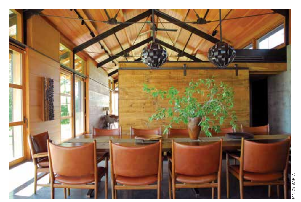
FROM TOP: There were two barns on the edge of the property, one was converted into a guest house and the other houses horses. • Vintage Lightolier light fixtures are suspended above a custom Claro walnut and bronze table paired with vintage Hans Wegner chairs. Sliding barn-style doors can close off the dinning room for additional privacy, but allow for an open flow to the floor plan.

In addition to representing the culture and history of the setting, the 4,000-square-foot home was also designed to be responsive to climate and to capitalize on the expansive views of the river valley. A southern orientation offered a clear line of sight